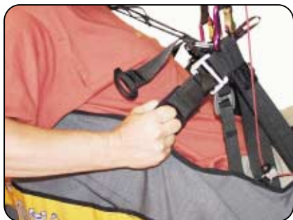
Adjusting of lateral straps

Adjustments can be made to the lateral straps leading through the flat buckles to your back. When correctly adjusted you feel only light pressure on both back and shoulder. If the lateral straps are too loose you will feel pressure on your shoulders from the shoulder straps. By pulling on them you change the position. If you feel pressure on your back, release the lateral straps by pulling the loop on the flat buckles within the tunnel of Neoprene material.