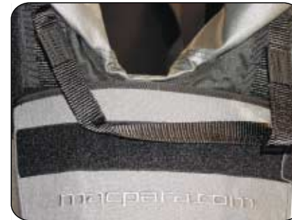
connection 1, 2