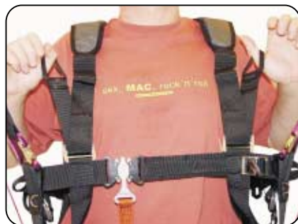
Adjusting of shoulder straps