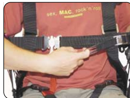
Adjusting of chest strap

The chest strap is secured with an automatic T buckle. This prevents any chance of the pilot falling out of the harness if he forgets to fasten the legs straps. The click must be audible. By adjustment of the chest strap the pilot determines the sensitivity of the harness and the ABS system. Adjustment of the distance between the main carabineers is made using the narrower strap leading through an adjustable trimmer placed on the left side of the chest strap. The harness is most sensitive to weight-shift when the trimmer is released. The shorter the distance between the main carabineers the less sensitive the harness becomes to weight shift and the effect of the ABS-system is increased. By pushing on the trimmer the chest strap can be released.