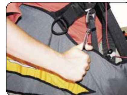
Adjusting of bottom lateral straps