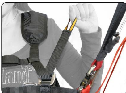
Adjusting the shoulder straps.