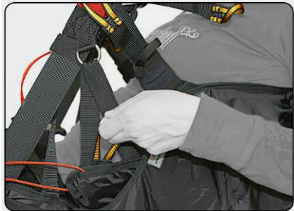
Adjusting the bottom lateral straps.