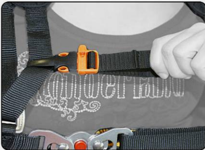
Adjusting the chest strap.

Adjustment of the distance between the main carabineers is made using the narrow chest strap leading through an adjustable flat buckle. The harness is most sensitive to weight-shift when the chest strap is released. The shorter the distance between the main carabineers the less sensitive the harness becomes to weight shift and the effect of the ABS-system is increased. By pulling the black coloured "release" loop the chest strap can be slackened.