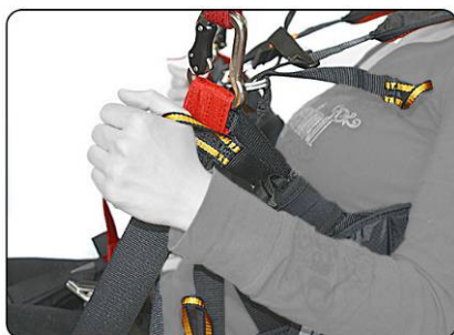
Adjusting the lateral straps.

When correctly adjusted you feel only light pressure on both back and shoulder. If the lateral straps are too loose you will feel pressure on your shoulders from the shoulder straps. By pulling on them you change the position. If you feel pressure on your back, release the lateral straps by pulling the loop on the flat buckles within the tunnel of Neoprene material.